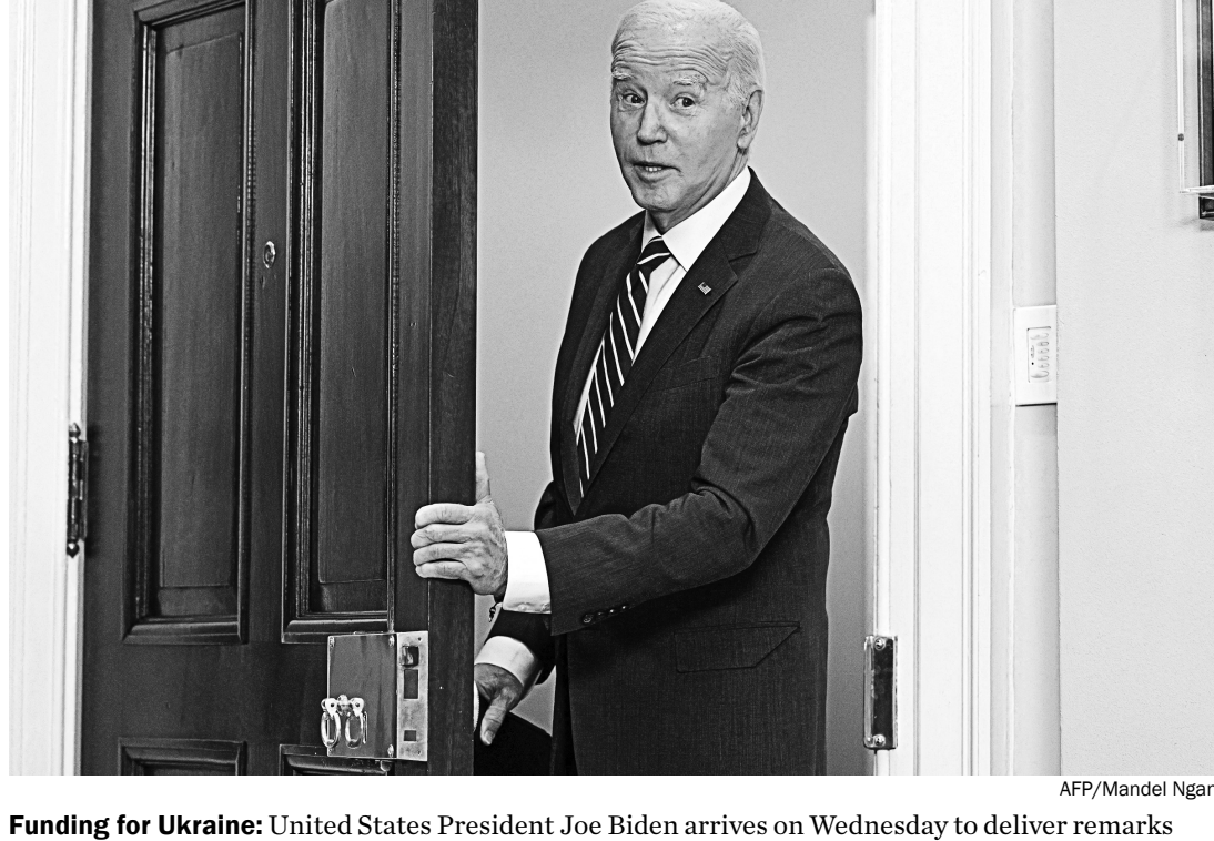
urging Congress to pass his national security supplement request, which includes funding to support Ukraine, in the Roosevelt Room of the White House in Washington, DC.

Biden has led the global coalition backing Kyiv, but support has been waning among Republicans in Congress, and the administration has warned that it will run out